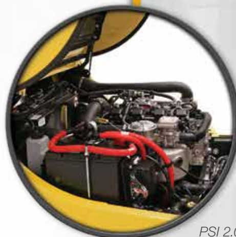
PSI 2.0L LPG industrial engine