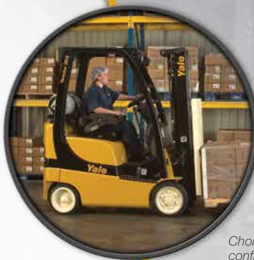
Choice of configurations for standard, medium and heavy duty applications

Two Yale transmission selections are available: the Standard Electronic Powershift and the Techtronix 100. All transmissions feature smooth electronic inching, electronic shift, and neutral start/ brake interlock. The optional Techtronix 100 transmission also provides controlled power reversal which reduces tire spin and conserves fuel, controlled rollback which maximizes control on grades (limiting roll to three inches per second), and Auto Deceleration System (ADS) which reduces brake pedal usage since ADS automatically slows the truck when the operator takes their foot off the throttle pedal. The controlled power reversal and ADS are fully adjustable to meet your application requirements.