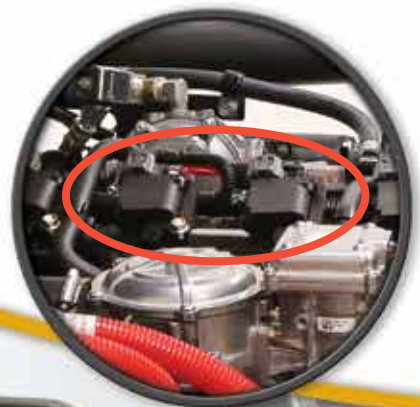
Coil over plug ignition design

The radiator is easy to access. The coolant recovery bottle is easily visible to check coolant levels. A coolant fill neck is located for easy reach.