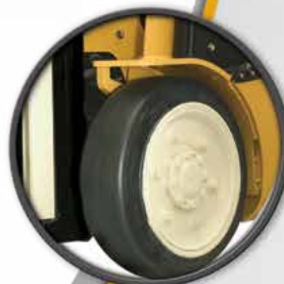
Auto Deceleration System and controlled power reversal available on the Techtronix 100 transmission