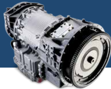
4000 RDS, 4500 RDS, 4700 RDS