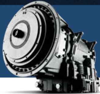
3000 RDS, 3500 RDS