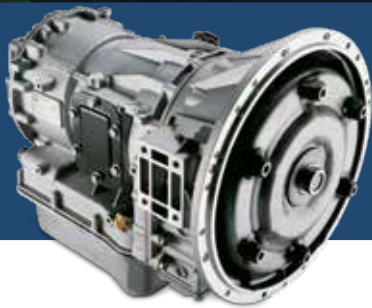
1000 RDS, 1350 RDS, 2100 RDS, 2200 RDS, 2300 RDS, 2350 RDS, 2500 RDS, 2550 RDS