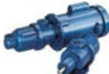
Small Progressing Cavity Pumps