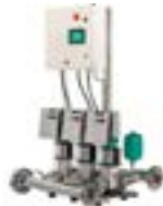
High-Efficiency Pressure Boosting Systems