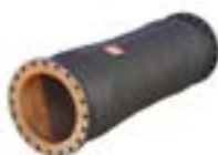
Heavy Duty Hose

TOWNLEY Engineering & Manufacturing Co., Inc.