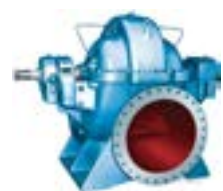
Split Case Pumps