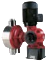
Motor Driven Diaphragm Dosing Pumps