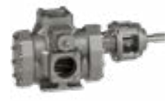
Stainless Steel Gear Pumps

NOTE: Certain brands may not be available in all Canadian provinces.