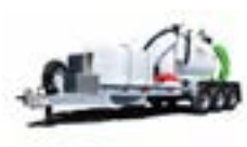
Viper™ Jetter Trailers