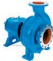
Paper Stock Pumps