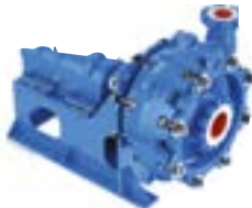
Slurry & Solids Handling Pumps