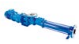
Compact C Progressing Cavity Pumps