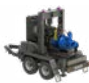
Medium Head Pumps