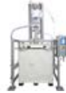
Bin & Drum Unloaders