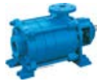
Multi-Stage Ring Section Pumps