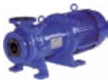
Magnetic Drive Large Chemical Process Pumps