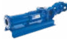
EZstrip™ Progressing Cavity Pumps