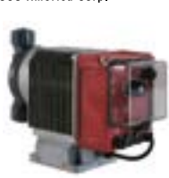
Solenoid Diaphragm Dosing Pumps