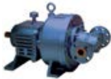
API 610 High Pressure Pumps