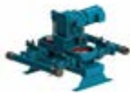
Double Diaphragm Pumps