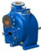
Self Priming Pumps