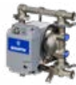
Electric Operated Double Diaphragm Pumps