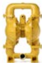
Large Air Operated Diaphragm Pumps