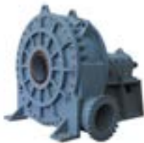
Slurry Pump Conversion Units