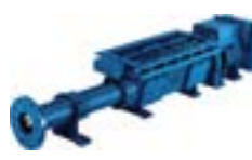
Large Progressing Cavity Pumps