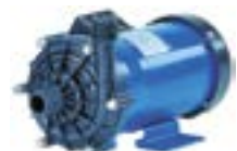
Magnetic Drive 1/2 to 5hp Pumps

NOTE: Certain brands may not be available in all Canadian provinces.