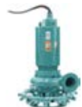
Submersible Slurry Pumps

VERSA-MATIC PUMPS Engineered to do more.