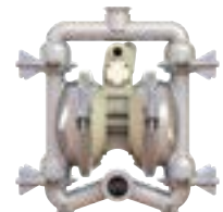
FDA Air Operated Diaphragm Pumps