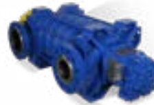
Multistage, Ring Section