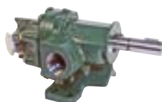
Small Gear Pumps