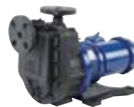
Magnetic Drive Self-Priming Pumps