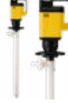
Motor Driven Piston Dosing Pumps