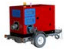
Quiet Solution Pumps