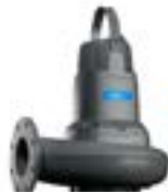
Clog Resistant Pumps