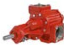
Process Gear Pumps