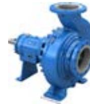
Heavy Duty Process Pumps