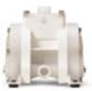
Small Air Operated Diaphragm Pumps

VERSA-MATIC PUMPS Engineered to do more.