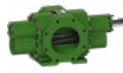
Bulk Liquid Handling Gear Pumps