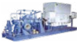
API Process Pumps