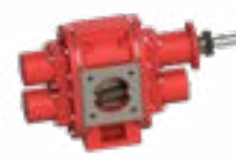
Abrasive Liquids Gear Pumps