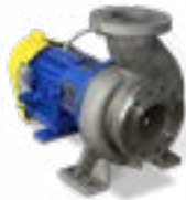
Heavy Duty Process