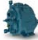
Self-Priming Wet Prime Pumps