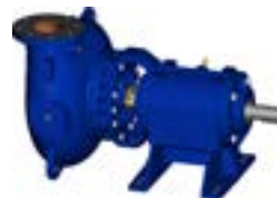
Food Transfer Pumps