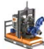
Sewage & Wastewater Pumps