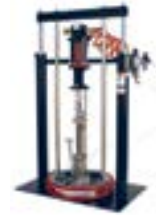
Piston Pumps & Packages