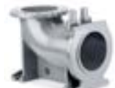
Discharge Connection and Guide System

TOWNLEY Engineering & Manufacturing Co., Inc.