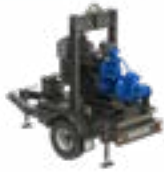
Contractor Low Head Pumps