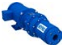
Magnetic Drive Pumps