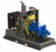
High Head HiMax Pumps