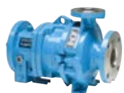
Magnetic Drive Pumps