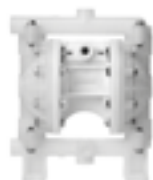
Medium Air Operated Diaphragm Pumps