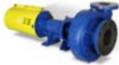
High Capacity End-Suction