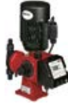
Hydraulically Actuated Diaphragm Dosing Pumps