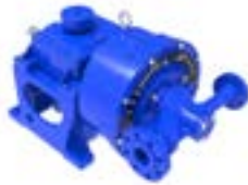
High Pressure Pumps