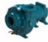
Self-Priming Dry Prime Pumps